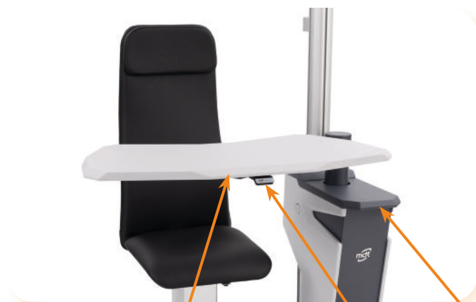
UNIQ with SLIM chair (right-handed setup)