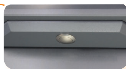
Table top electromagnet lock switch