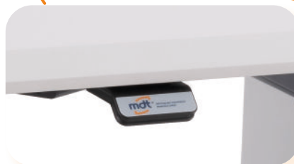
Chair height adjustment switch