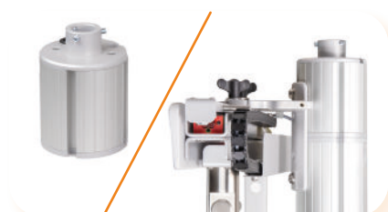
Alu post extension