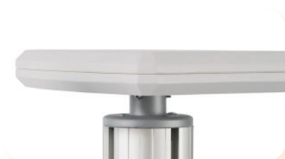
Chart projector shelf*