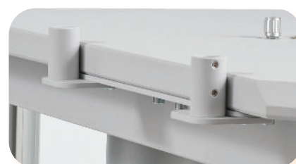
Chin rest adapter