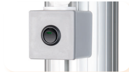
LED lamp switch